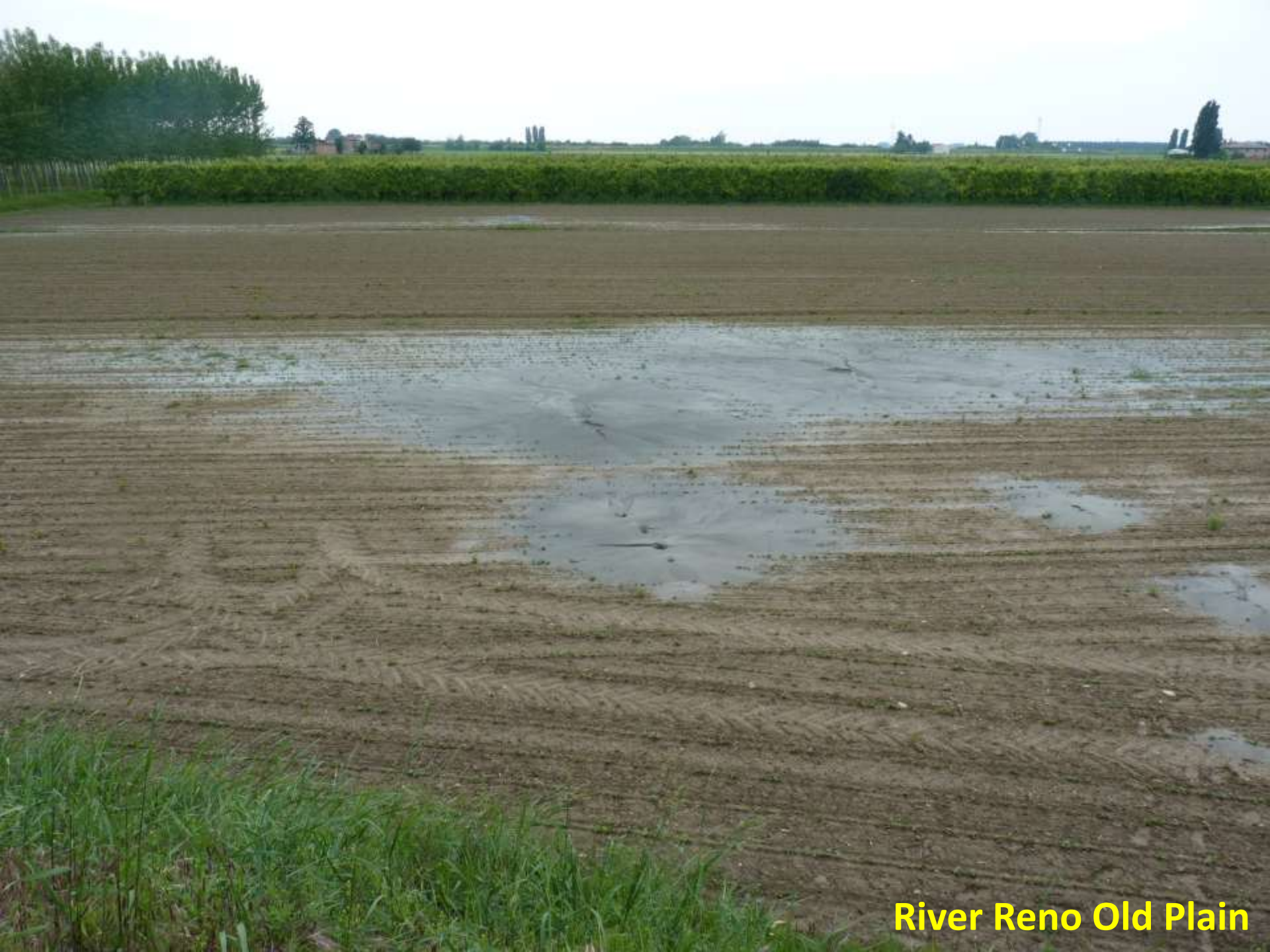
River Reno Old Plain