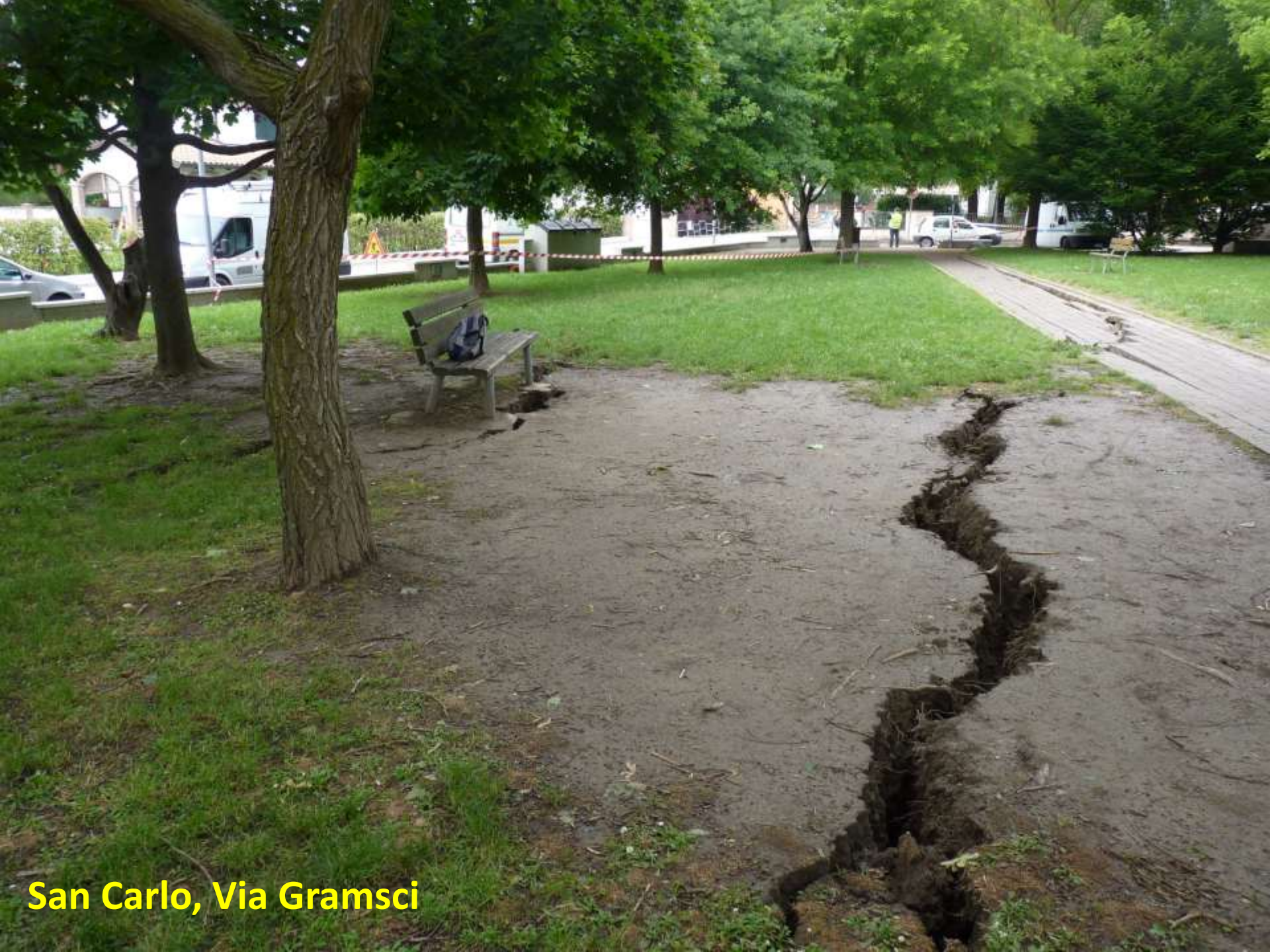
San Carlo, Via Gramsci