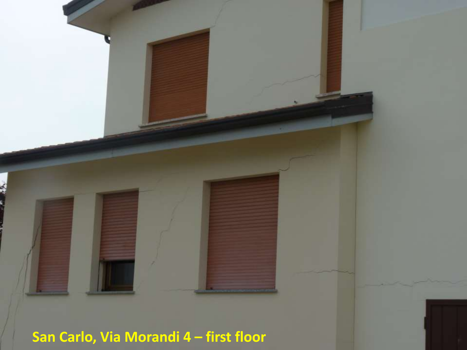
San Carlo, Via Morandi 4 – first floor