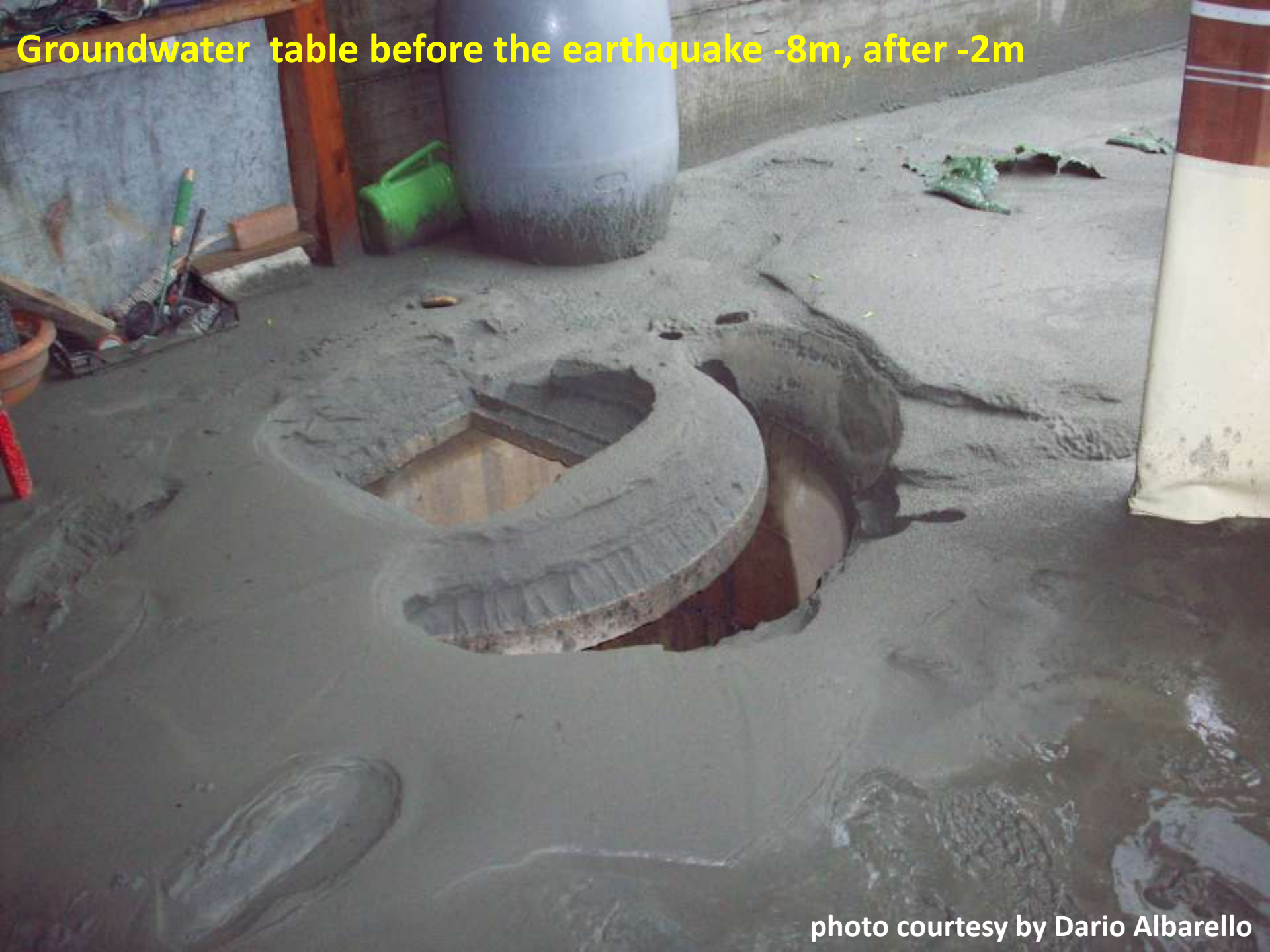
Groundwater table before the earthquake -8m, after -2m