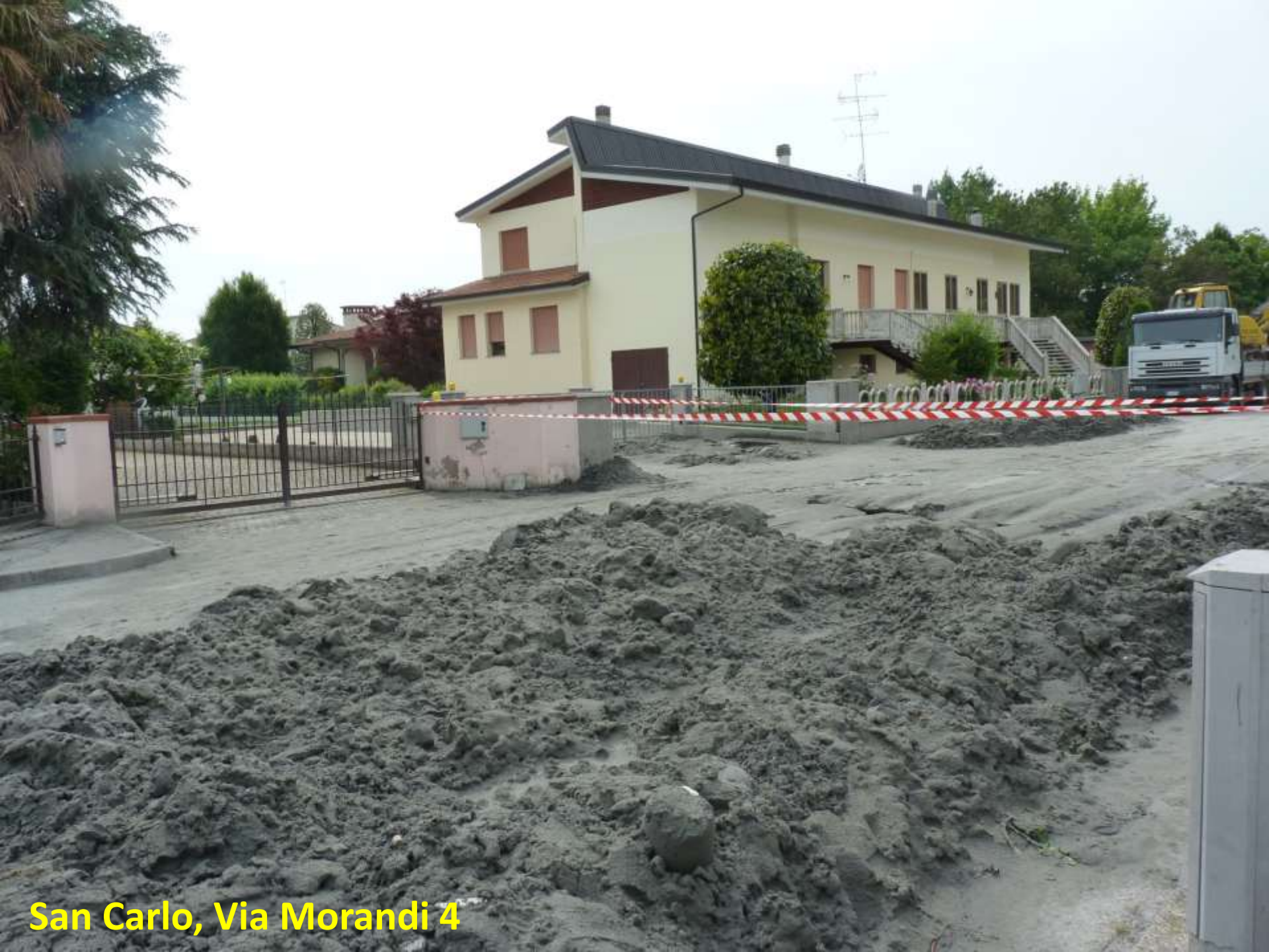
San Carlo, Via Morandi 4